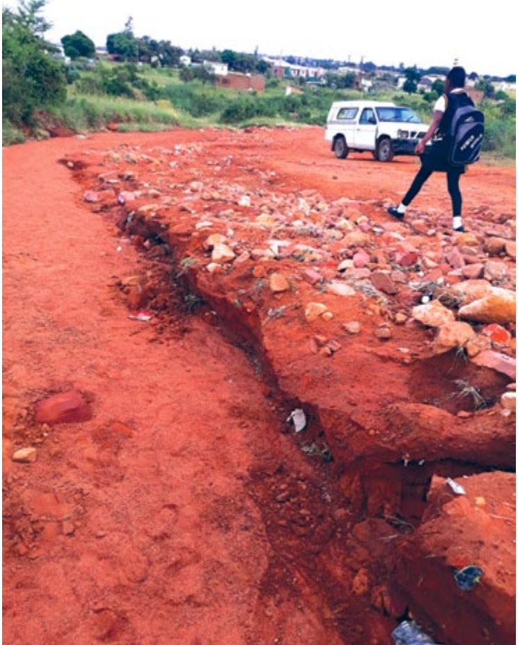
The inaccessible badly damaged roads in Tafelkop Village. Motorists are urged to turn away and use alternative routes.

nately the roads were affected after recent heavy rains. We appeal to residents to be patient as the programme will be back in the village as soon as other communities are covered," he said.