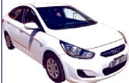
2013 Hyundai Accent 1.6 Motion 145 000Km NOW - R119 900