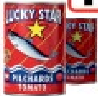
Lucky Star Pilchards