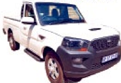
2016 Mahindra 90 M Hawk Scorpio 99 500Km NOW - R239 900