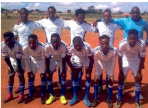
Herbzer Sports and Skills Development Football Tournament winners, Winnie Makua Stars FC walked away with R1000-00 cash prize.