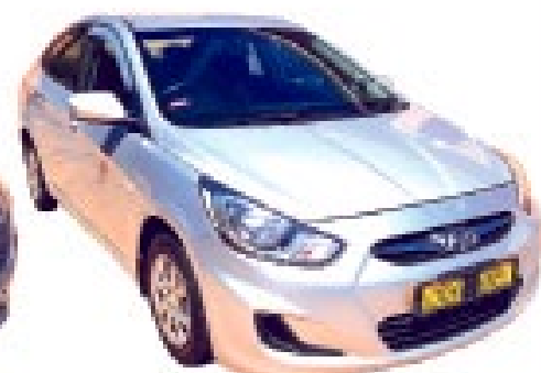
2013 Hyundai Accent 1.6 Motion 110 500Km NOW - R119 900