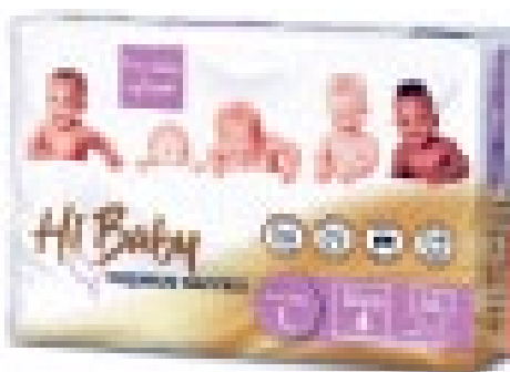
Hi Baby Wipes