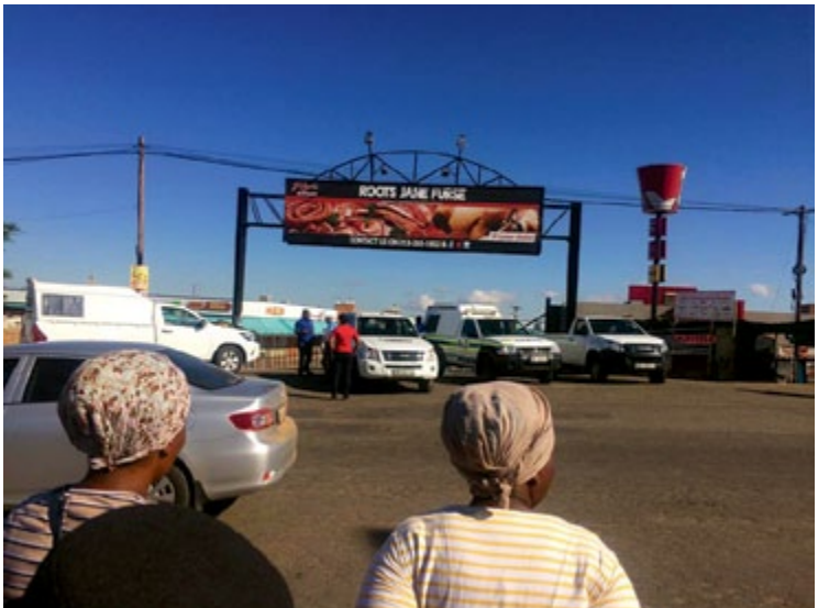
A gang of armed robbers stormed in and robbed shops at the Jane Furse Plaza.

He said a security guard was shot and killed in the process. "The guard was trying to flee from the scene and unfortunately he was shot and died immediately. The security company started working in the plaza for only five days when the unfortunate incident occurred," he said. The police said cases of armed robbery and murder were opened and under investigation. No arrests were made at the stage.