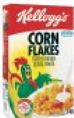
Kellogg's Corn Flakes