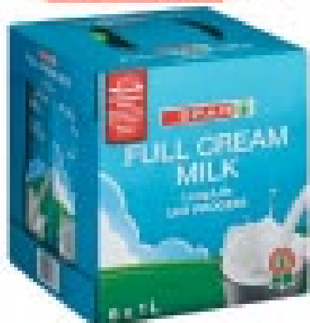
SPAR Life Milk