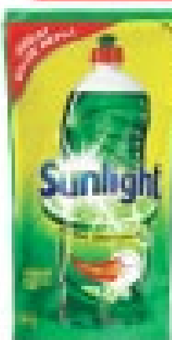
Sunlight Dishwashing Liquid Refill Pouch