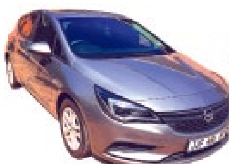
2017 Opel Astra 1.6 ECCOFlex 42 000 Km NOW - R169 900