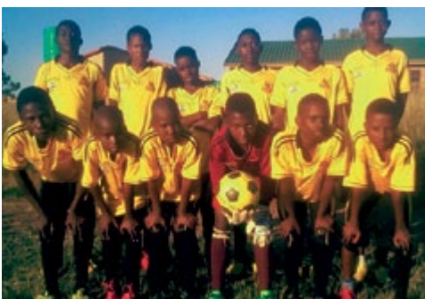
The Herbzer Sports and Skills Development Football Tournament runners-up and host, Herbzer Sports Academy FC did not go home empty handed and walked away with R600-00 cash prize.

and address young people about the negative impacts of crime, alcohol and drug abuse. This will be the platform where the MEC will be able to liaise with a large number of young people and hopefully the message will make a positive impact in this young generation. Our aim is to take them from doing bad things through sports participation," he said.