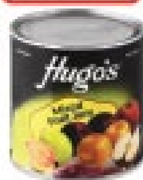
Hugo's Fruit Jam