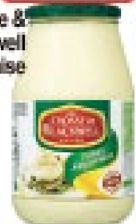
Crosse & Blackwell Mayonnaise