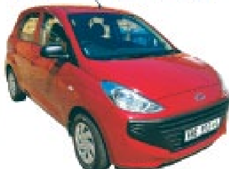
2019 Hyundai Aios 1.6 Motion 10 800Km NOW - R139 900