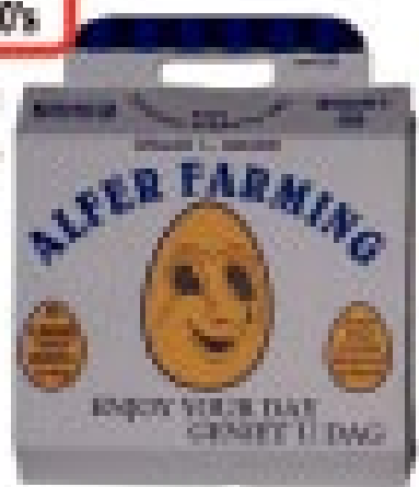
After Farm Large Eggs