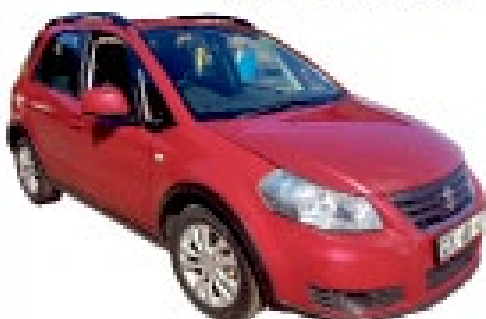
2013 Suzuki 2.0 AWD SX4 66 500 Km NOW - R149 900