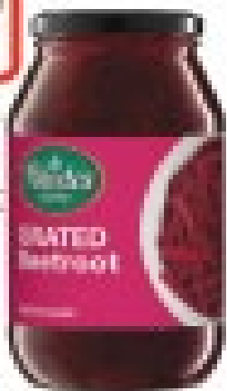
Rhodes Grated Beetroot