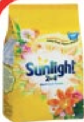
Sunlight Hand Wash Regular