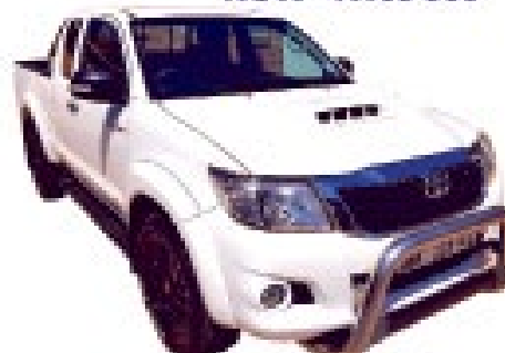
2017 Toyota Hi-Lux 3.0 D4D Dakar 4x4 185 000 Km NOW - R275 900