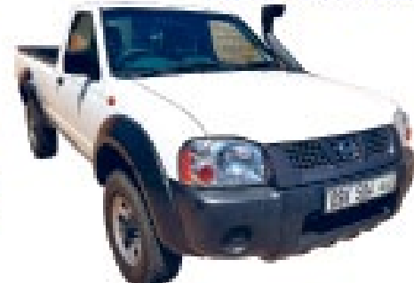
2017 Nissan Hardbody 2.4 4x4 5/C 42 000 Km NOW - R179 900