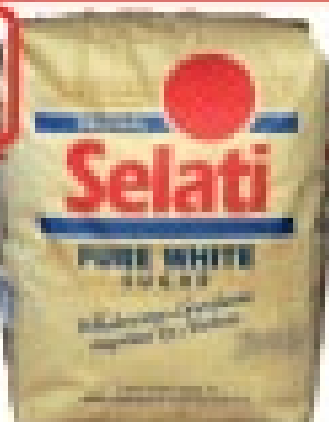
Selati White Sugar